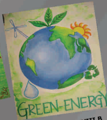
Upasana Shah -VIII B