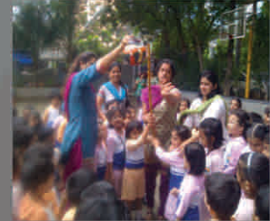
WE LOVE OUR COUNTRY INDIA

In the month of AUGUST ,we celebrated JANMASHTAMI, birth of LORD KRISHNA. Children assembled on the school ground and there was Dahi Handi Celebration,Which was full of GOODIES that were distributed among children.