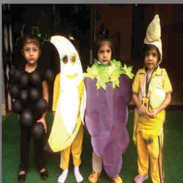
Healthy, Wealthy & Wise

STORY TIME-Stories help to create imagination in children and at the same time it is an enjoyable activity. This helps the children to develop their listening and communication skills. Thus story telling is an integral session in pre-primary section.