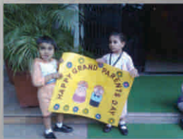
We love stories